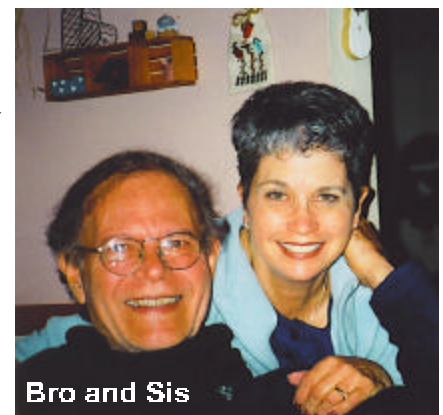
Bro and Sis