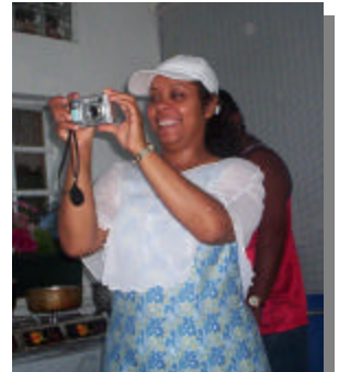
...we took pictures...