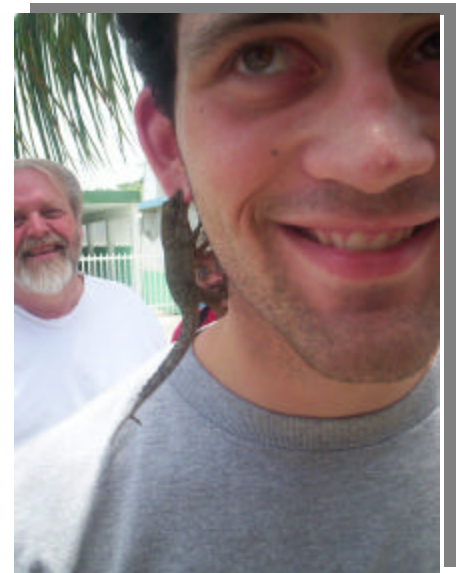
...we enjoyed the wildlife...