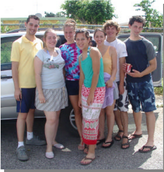
...we posed for pictures...