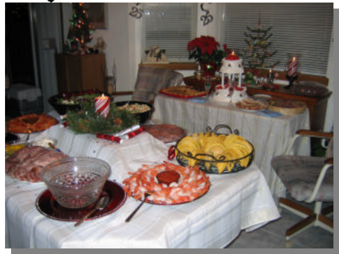
This is just part of the food—there were three tables full!