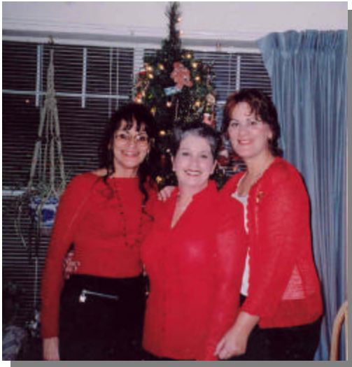
The "Golden Girls" gather again.