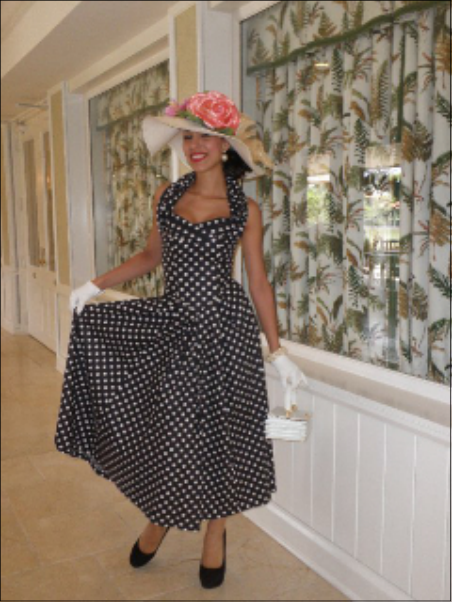
Check out our new online store! www.circavintageshoppe.com