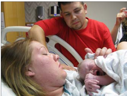
Bonding with Mommy.