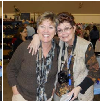
“I'm so happy!”