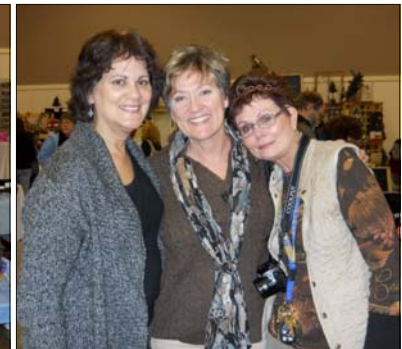
The three of us together.